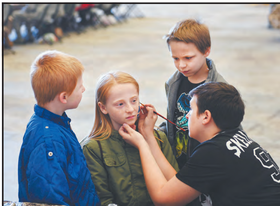
A group of children get their faces painted by a volunteer at a Kids Understanding Deployment Operations event at Little Rock Air Force Base on Oct. 19. The children were able to see first-hand some of the aspects of what takes place when their parents deploy.