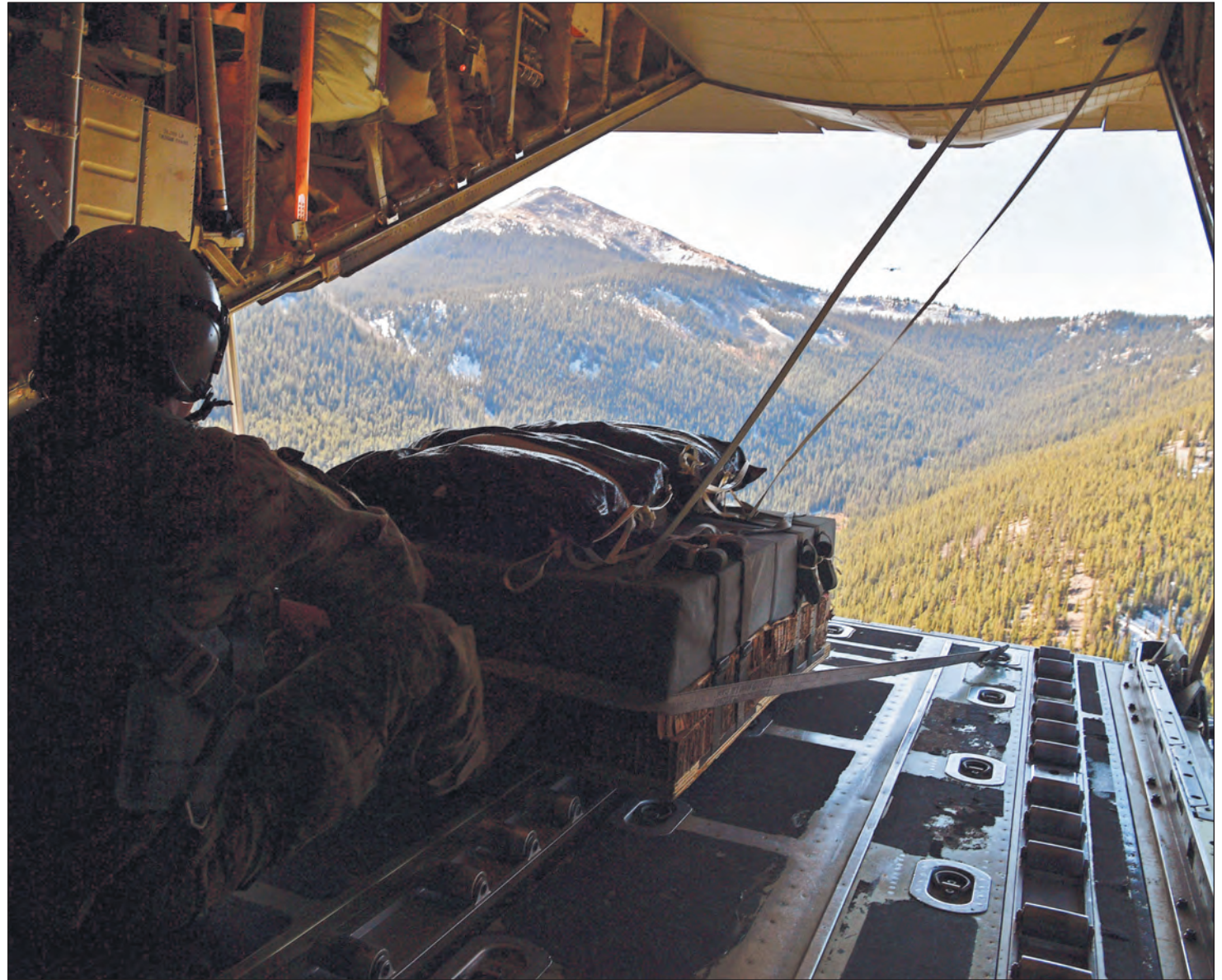
U.S. Air Force Tech. Sgt. Jonathan Parker, 29th Weapons Squadron instructor loadmaster, prepares to release a bundle from a C-130J Hercules during phase three of the C-130 Weapons Instructor Course over Colorado on Oct. 14. The purpose of WIC is to both teach instructor pilots and instructor navigators to become tactical experts of the C-130 Hercules in a cross-domain battlespace, and charging them to take their experience to train their respective units, increasing overall combat capability and lethality of the force.