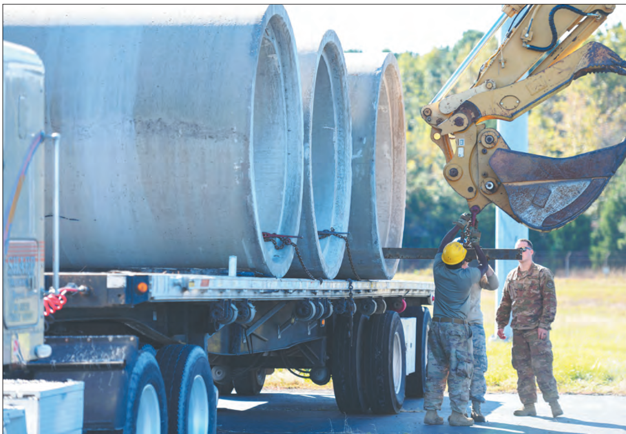
Airmen from the 19th Civil Engineer Squadron secure a bunker at Little Rock Air Force Base on Oct. 18. In preparation for the upcoming ROCKI 20-01 exercise, which begins Nov. 4, the 19th CES set up defensive fighting positions and bunkers by the flight line to add to the realism of training during the exercise.