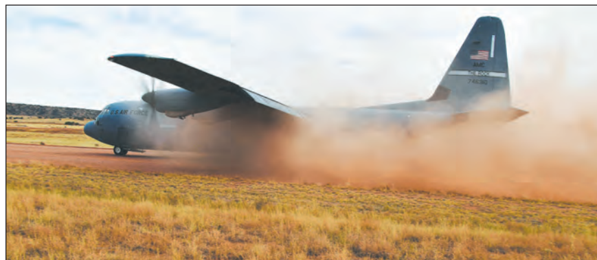
A C-130J Hercules prepares to takeoff from a dirt runway, during phase three of the 29th Weapons Squadron C-130 Weapons Instructor Course, at Red Devil Landing Zone in Colorado on Oct. 17. The course consists of four phases building C-130 Hercules tactical experts, taking six months to complete.