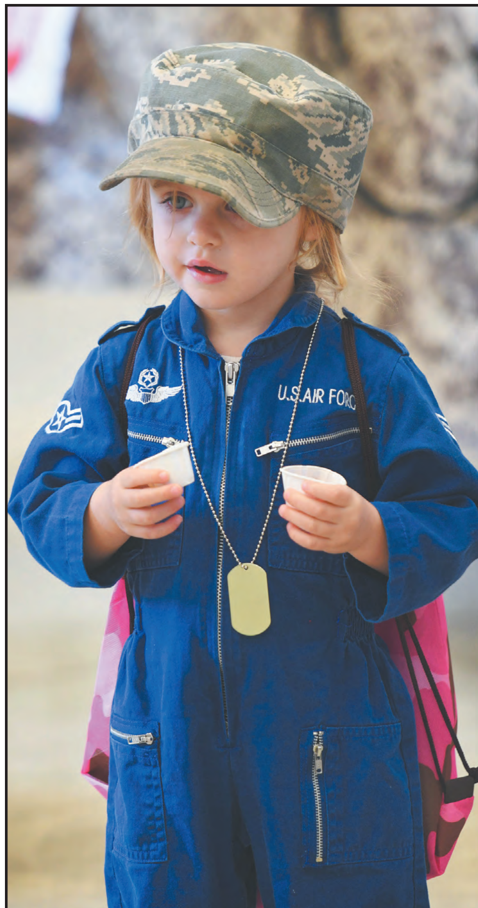
A child walks away from a simulated personnel deployment function line during a Kids Understanding Deployment Operations event hosted by the Airman and Family Readiness Center at Little Rock Air Force Base on Oct. 19. Airmen from across Little Rock Air Force Base enhanced family readiness with a Kids Understanding Deployment Operations event on Oct. 19.