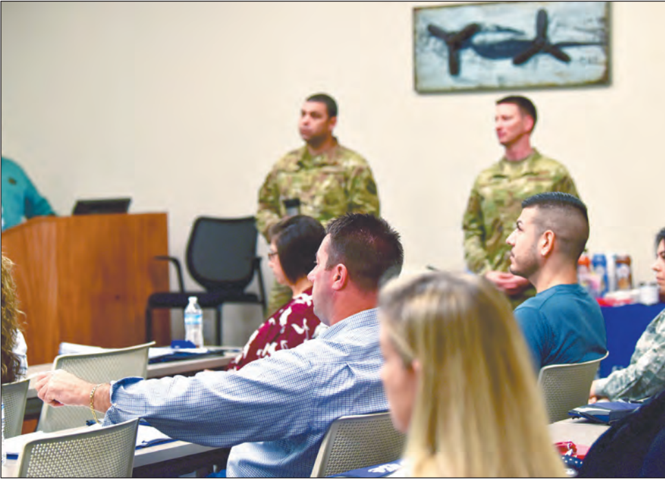
Team Little Rock spouses receive a briefing during a senior leader spouse immersion at Little Rock Air Force Base on Oct. 21. The immersion included visits to key areas around LRAFB with the intent of familiarizing spouses on the base to better equip them in assisting Airmen and their families.